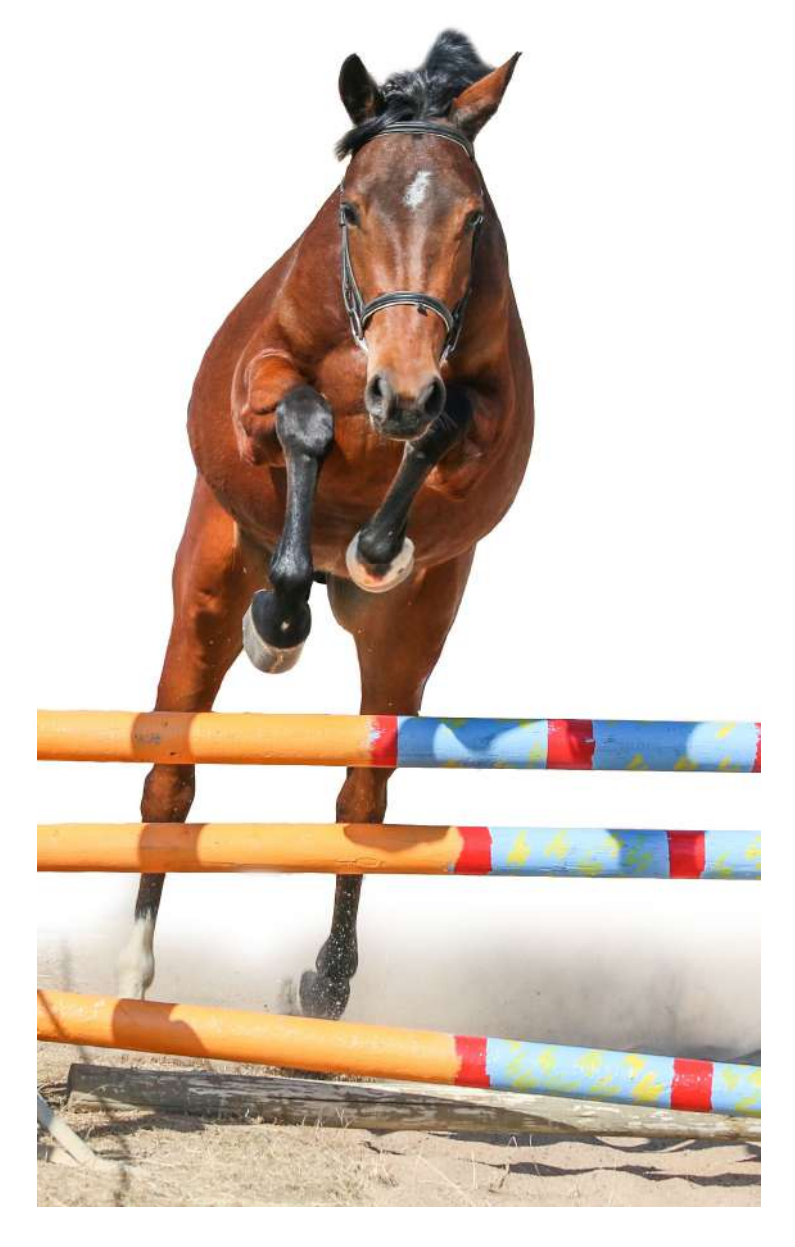
Sunny Park Stables Secret Icon

First Acceptance young stallions with show jumping pedigrees will be Free Jumped during their presentation.